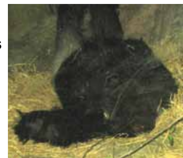
Mr. Gorilla, joined us for dinner.